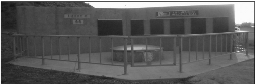
The BMC Life Members Memorial Wall at the BMC Grounds

Continue to improve our facilities, events, and safety for our future of riding, and racing.